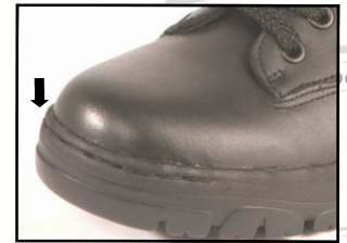
Lateral stitch for a high resistance sole