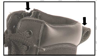
Eyelet and zip for an easy and quick fitting

SOLING TECHNOLOGY Cemented assembly with lateral stitches on the back and on the front for an increased resistance. Wear resistant spike outsole, Resistance to fuel oil, Energy absorbing heel, Suited grip for all kind of fields, Extremely slip resistant.