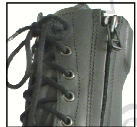
2 lateral zipper