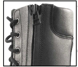
Upper top padding